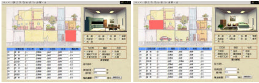
Figure 4. A sample of using room-function assignment as a filter in WIDE-Roadhouse.

Both WIDE-Kindom and WIDE-Roadhouse prototypes were exhibited in the "Construction and Automation 2000" exposition in Taipei. During the weeklong exposition, these prototypes were tested by visitors and received encouraging comments.