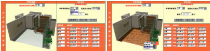
Figure 1. An example of using wall finishes and floor surfaces as filters in WIDE-Kindom.

WIDE-Kindom prototype implements the first two levels of design interaction: it allows users to identify suitable apartment units according to size, price, and Feng-Shui considerations and to customize selected units through various means. The results of user interaction in WIDE-Kindom are results of the information filtered through the component-and-assembly database. Figure 1 and 2 illustrate how design solutions change when a user identifies different design concerns.