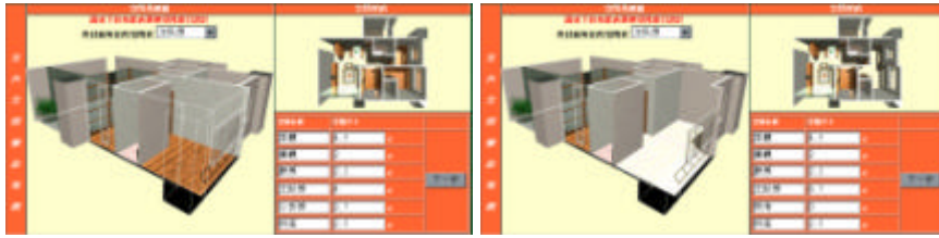
Figure 2. An example of using room combinations as filters in WIDE-Kindom.

WIDE-Roadhouse is the second prototype. It is specially tailored for roadhouses, which are typical in rural areas of Taiwan. During the 921 earthquake in 1999, many roadhouses were destroyed. WIDE-Roadhouse prototype is set up to allow users quickly evaluate possible designs for rebuilding. The component-and-assembly database of WIDE-Roadhouse is similar to that of WIDE-Kindom. The knowledge encapsulated in this prototype is a roadhouse building system with improved structural performance and constructional efficiency (see Figure 3).